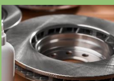
3 - RINSE