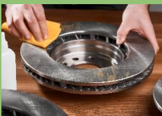
1 - PRE-CLEAN