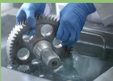
2 - SOAK