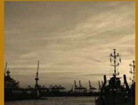
Stacking & Preservation